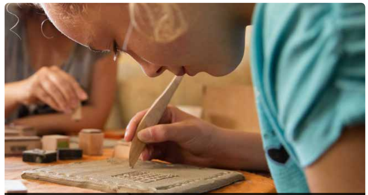
'Community Maker' project, making tiles to be installed in the Portland Inn community centre

'Community Maker' has contributed to the creation of an active community group of residents eager to play their part in its renaissance. Participants said it had a positive impact on their perception of the area, its heritage and people. In total, 256 residents took part in activities including walks, ceramic workshops and meals. Feedback from participants included: "It was wonderful to see so many people getting involved, as well as lots of young people who brought some great ideas," and "I enjoyed meeting useful people to help our growing community."